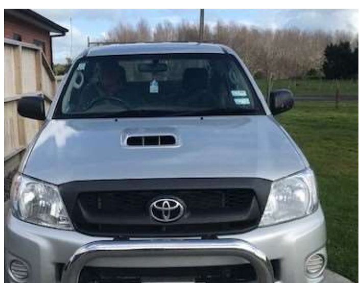
has anyone seen this car?

The above not so strange sight was seen at a vacant section in Terminus Street in early August. Boy racers are not an unusual sight these days as in many NZ towns. The above was recorded the day after our Tim had visited a neighbouring house to watch our women's footballers tumble out of the World Cup. Tim...he was rumoured to have got stuck in some rather swampy ground, the above being the end result. So, if you have strange ruts in yours or a neighbour's paddock...and Tim's been in the area....then you know who has been responsible. Call on "Rigter's Racers".